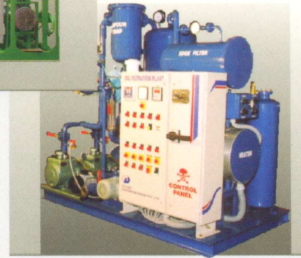
Portable Caster Wheel Mounted